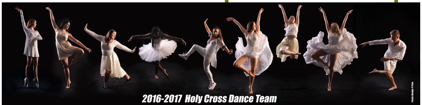
2016-2017 Holy Cross Dance Team

On Thursday, January 19, the Holy Cross Crusader Boys' Basketball Teams battled their arch-rival Regiopolis-Notre Dame Panthers in the 28th Annual Memorial. The Senior Crusaders overwhelmed the Panthers 53-47 while the Juniors fell 48-31.