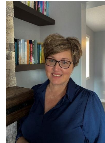
St. Thomas More CS