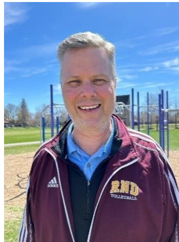
Regiopolis-Notre Dame CHS