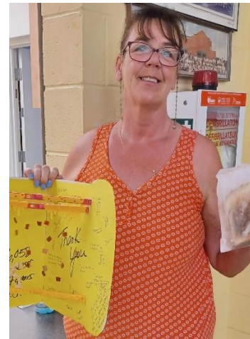
J.J. O'Neill CS